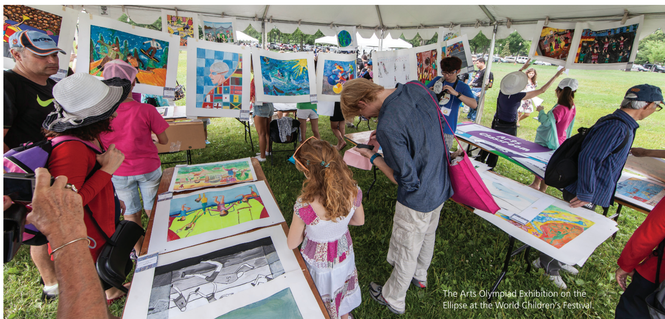
The Arts Olympiad Exhibition on the Ellipse at the World Children's Festival.