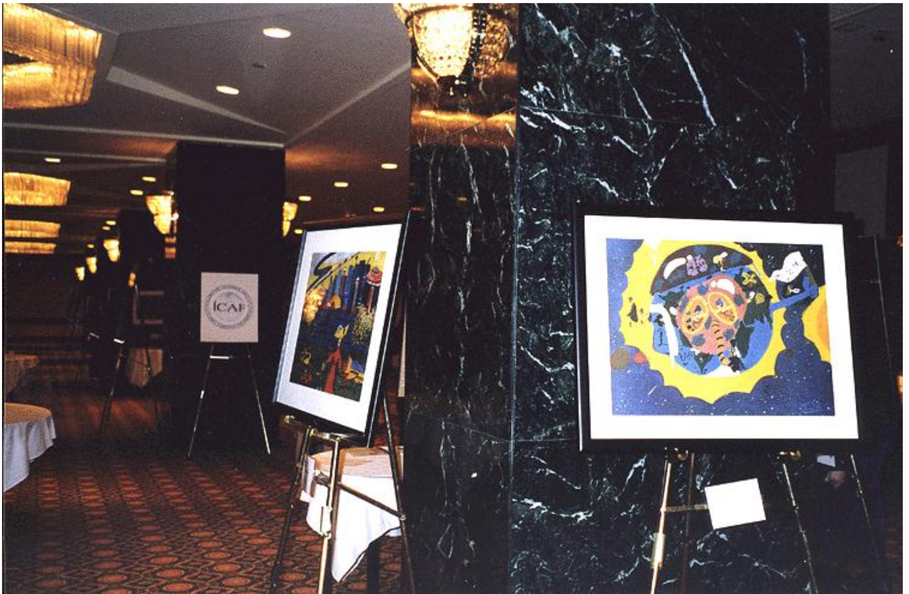
Children's Visions of the Millennium at the New York Hilton during the United Nations Millennium Summit in March 2000