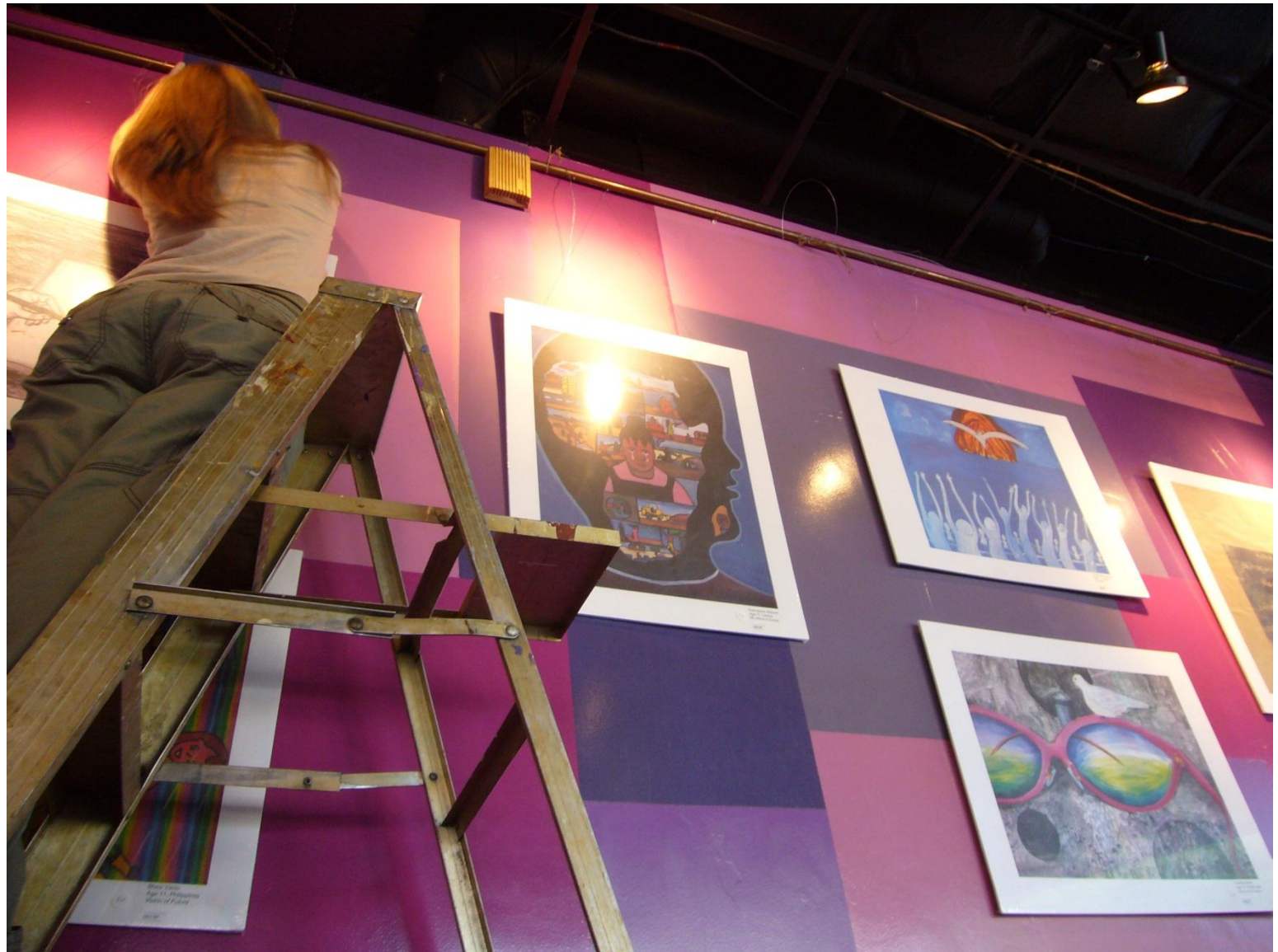
Exhibition setup at Soho Café in Washington, DC in August 2007