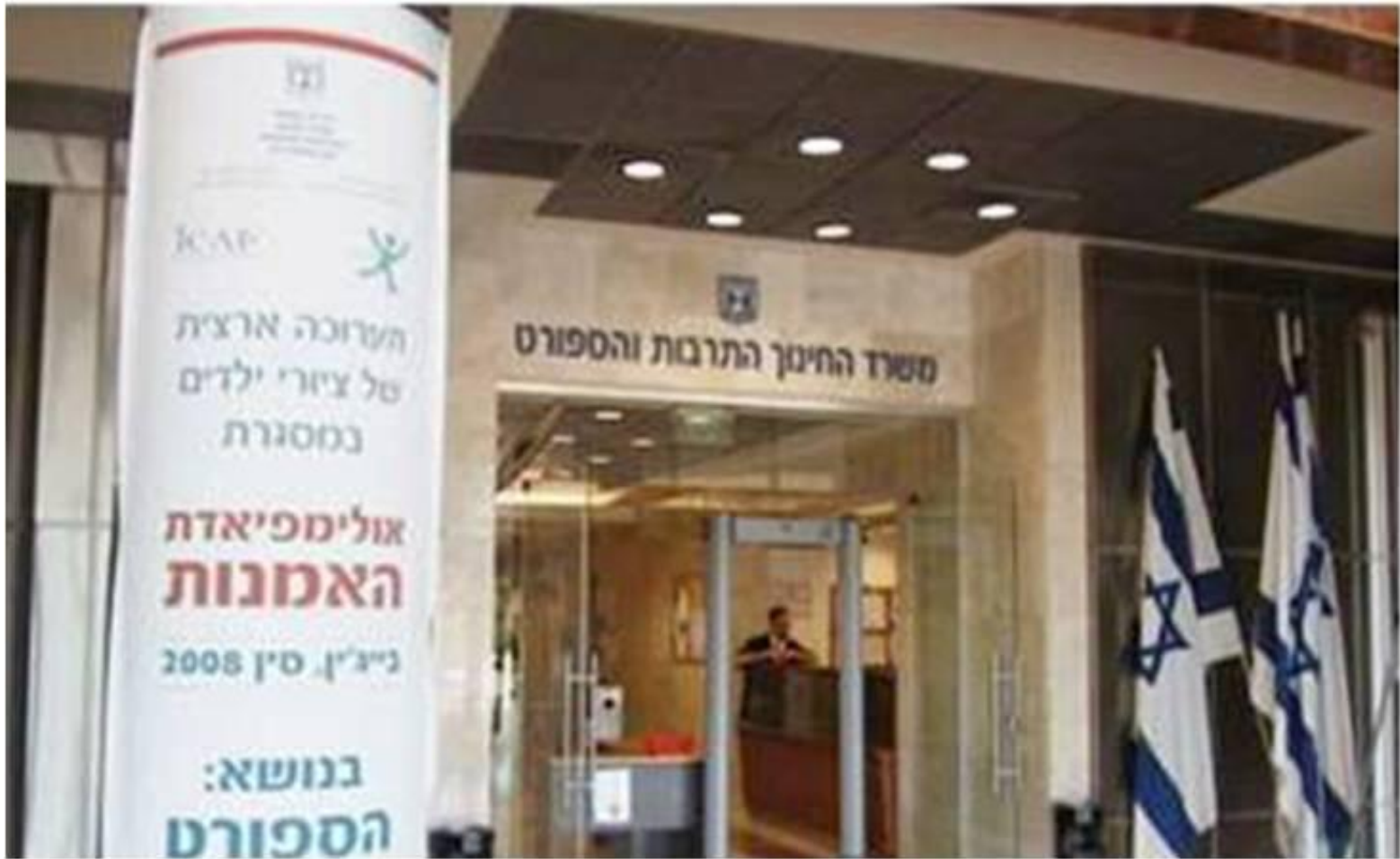
The Arts Olympiad Exhibition at the Ministry of Education, Culture and Sport, Tel Aviv, Israel