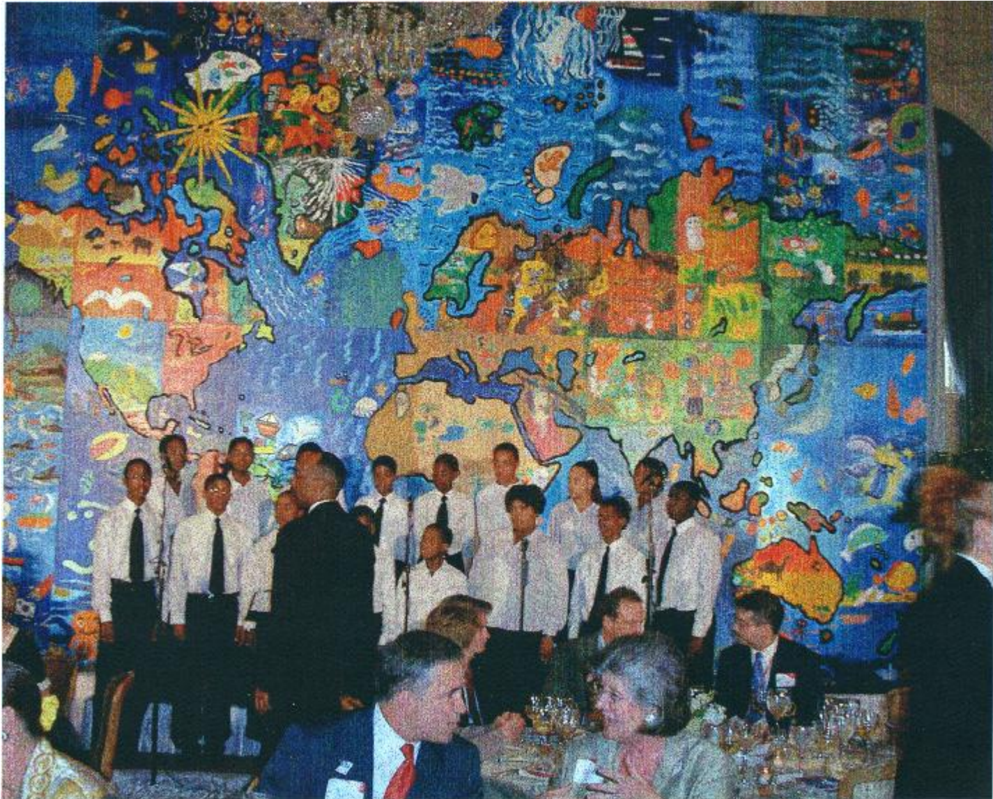
Children's World Mural at the OAS Building, Washington, DC at the Washington DC 2012 Site Evaluation reception for the U.S. Olympic Committee in June 2002