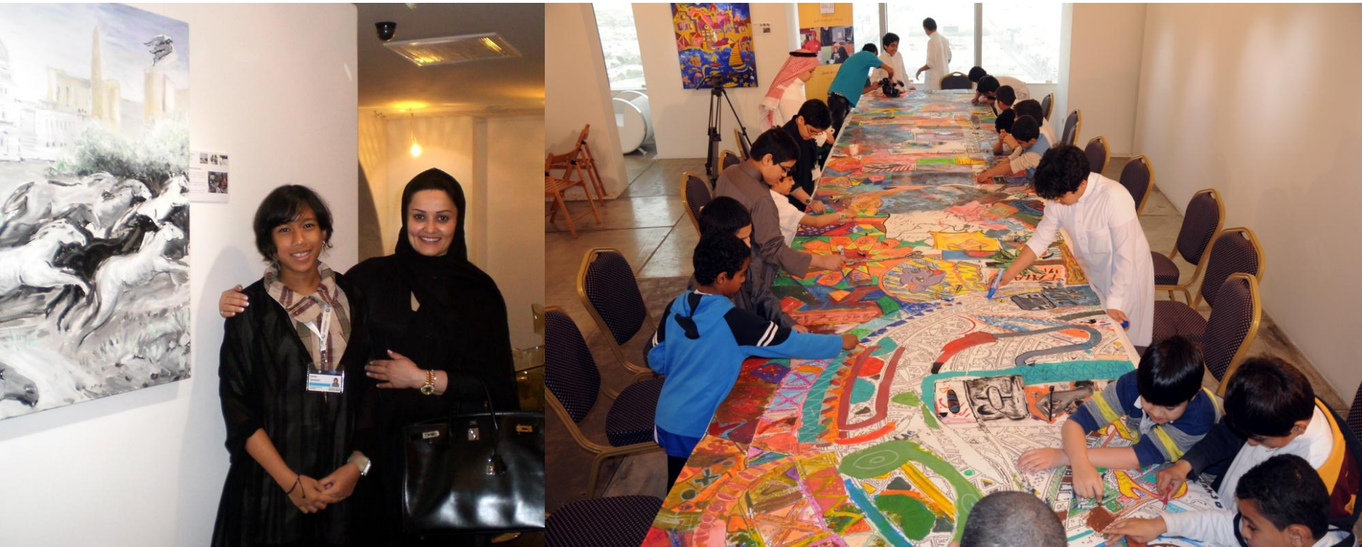
Exhibition and art creation at the Hwar Art Gallery in Riyadh, Saudi Arabia in January 2010