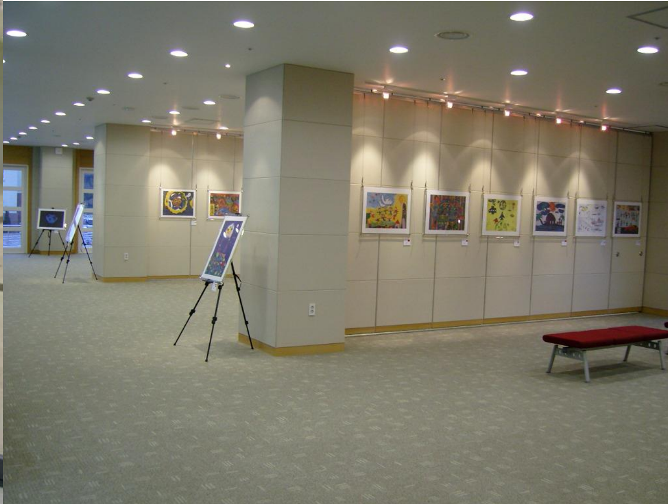
Children's Visions of the Future Exhibition at Yeungjin College in South Korea in April 2007