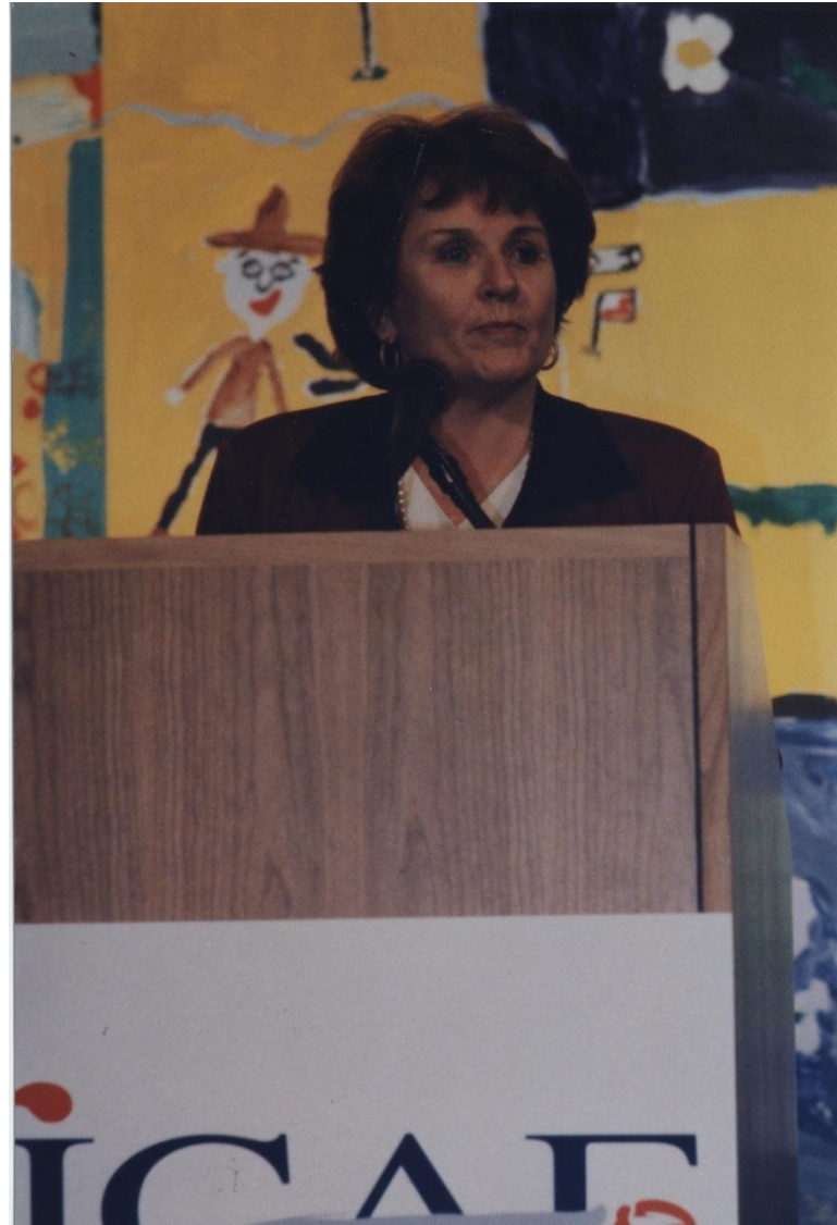
Exhibition opening address by Congresswoman Louise Slaughter, Co-Chair, Congressional Arts Caucus, at the Ronald Reagan Building, Washington, DC at the ChildArt USA Festival Award Ceremony in September 1998