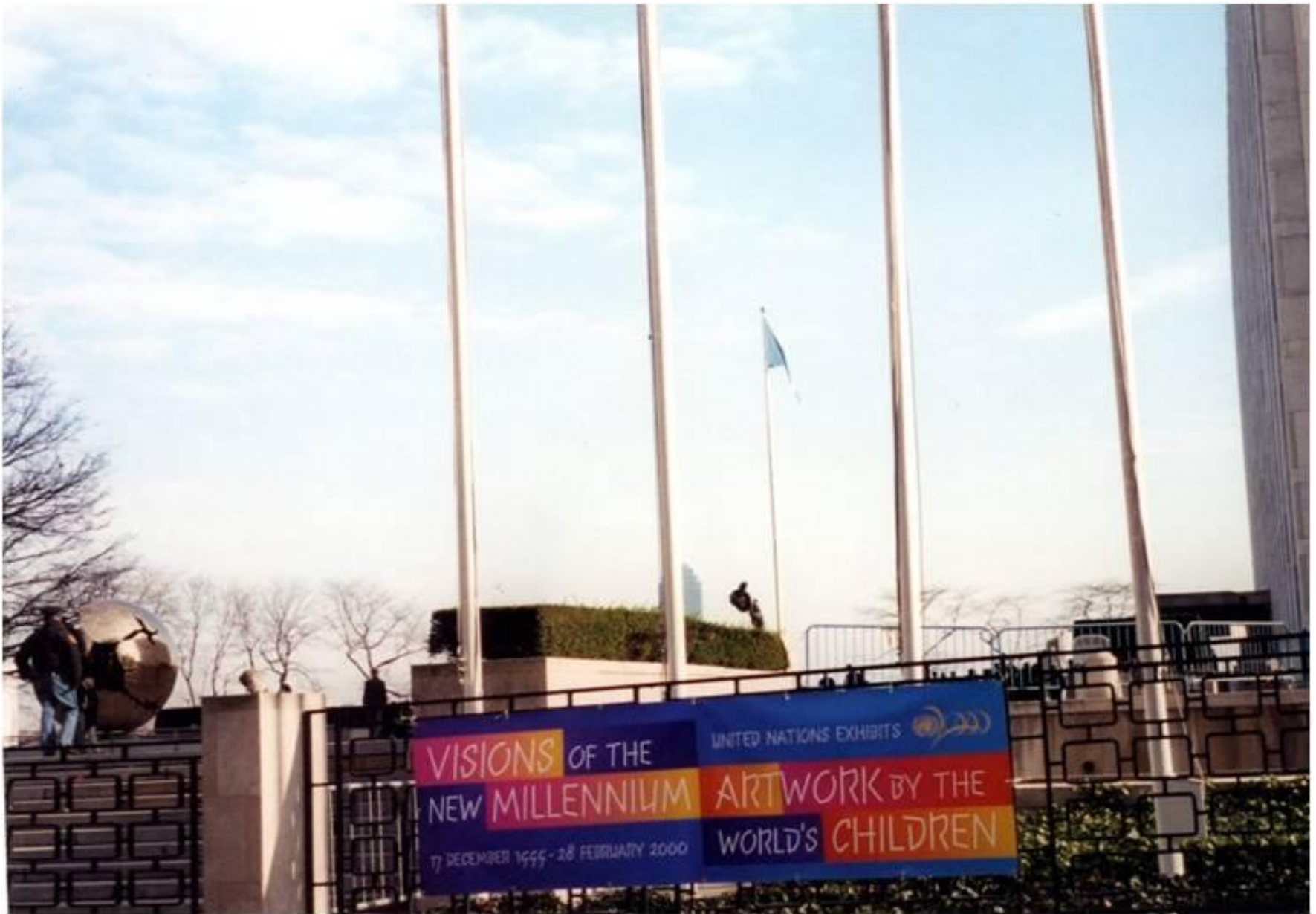
Children's Visions of the New Millennium Exhibition at the United Nations Headquarters in New York in December 1999 - February 2000.