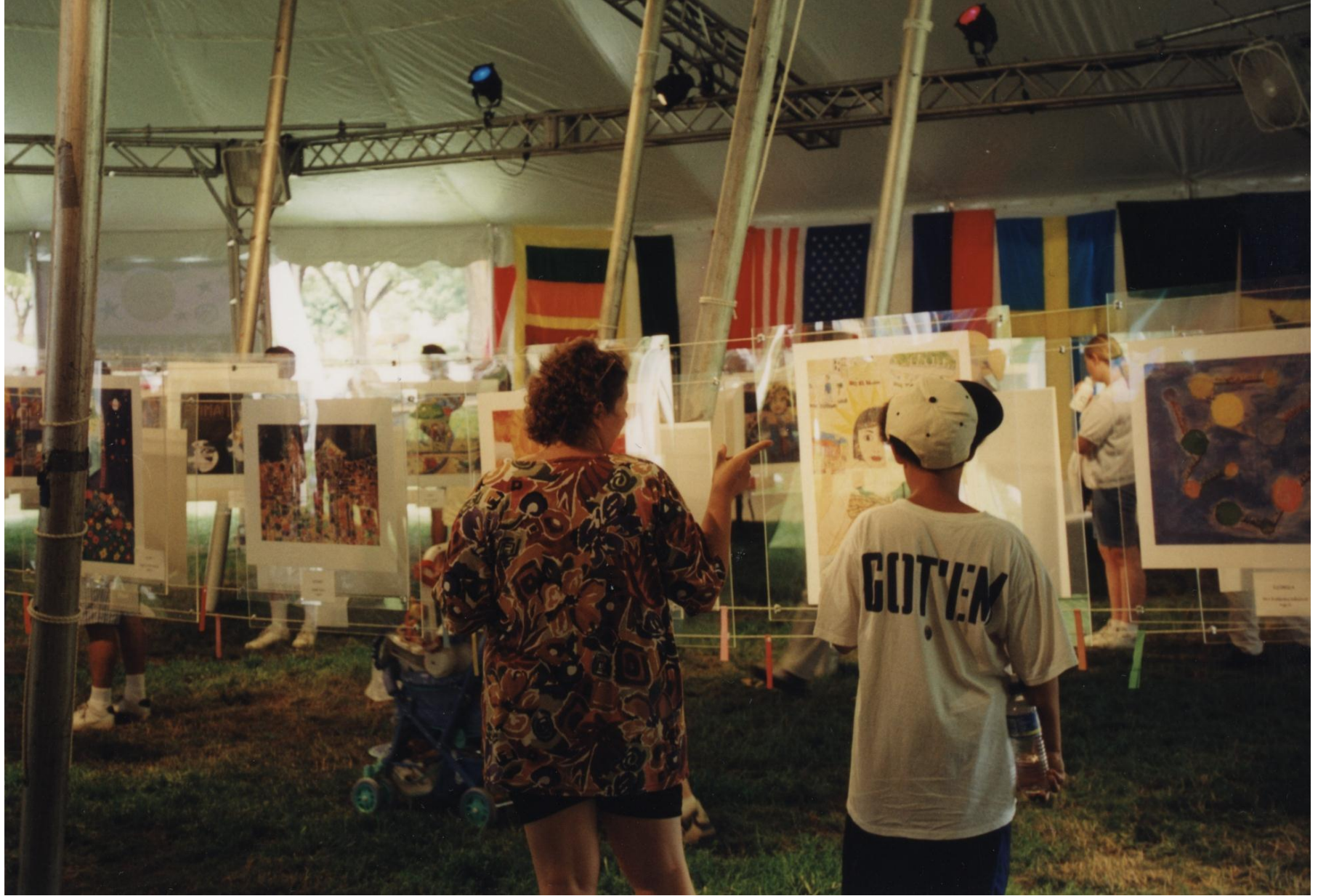
First Arts Olympiad Exhibition across from the National Gallery of Art on The National Mall in Washington, DC in September 1999