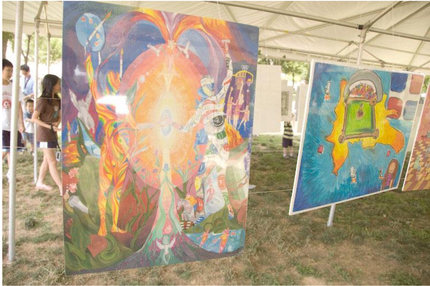
Third Arts Olympiad Exhibition on The National Mall in Washington, DC in June 2007