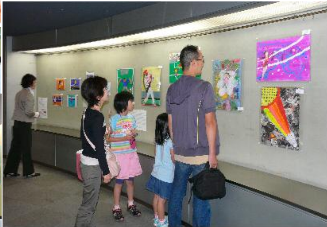
Arts Olympiad Exhibition at the National Children's Castle in Tokyo, Japan in May 2010