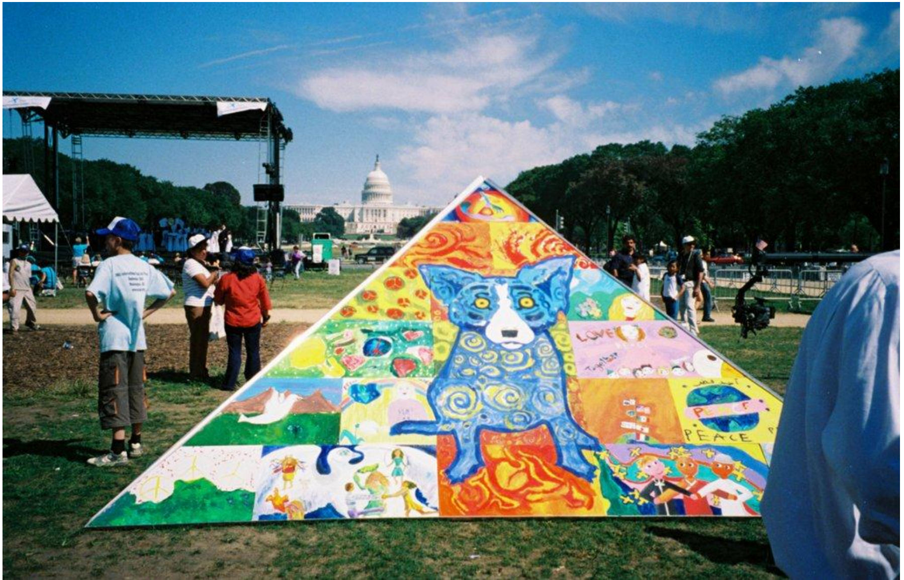
Pyramid of Peace on the National Mall in Washington, DC in September 2003