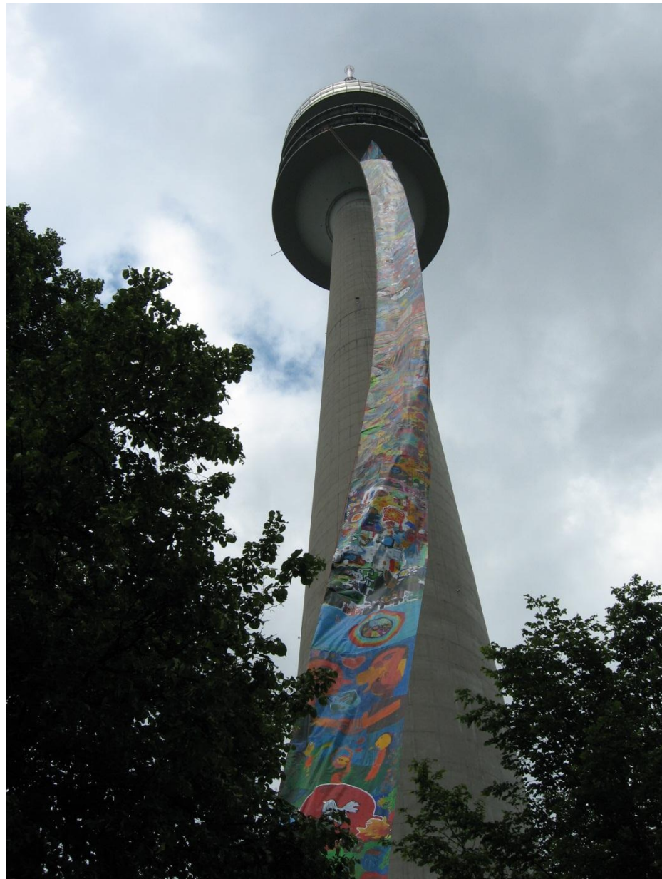
ICAF's European Children's Festival and display at the Olympia Park in Munich, Germany, in May 2006