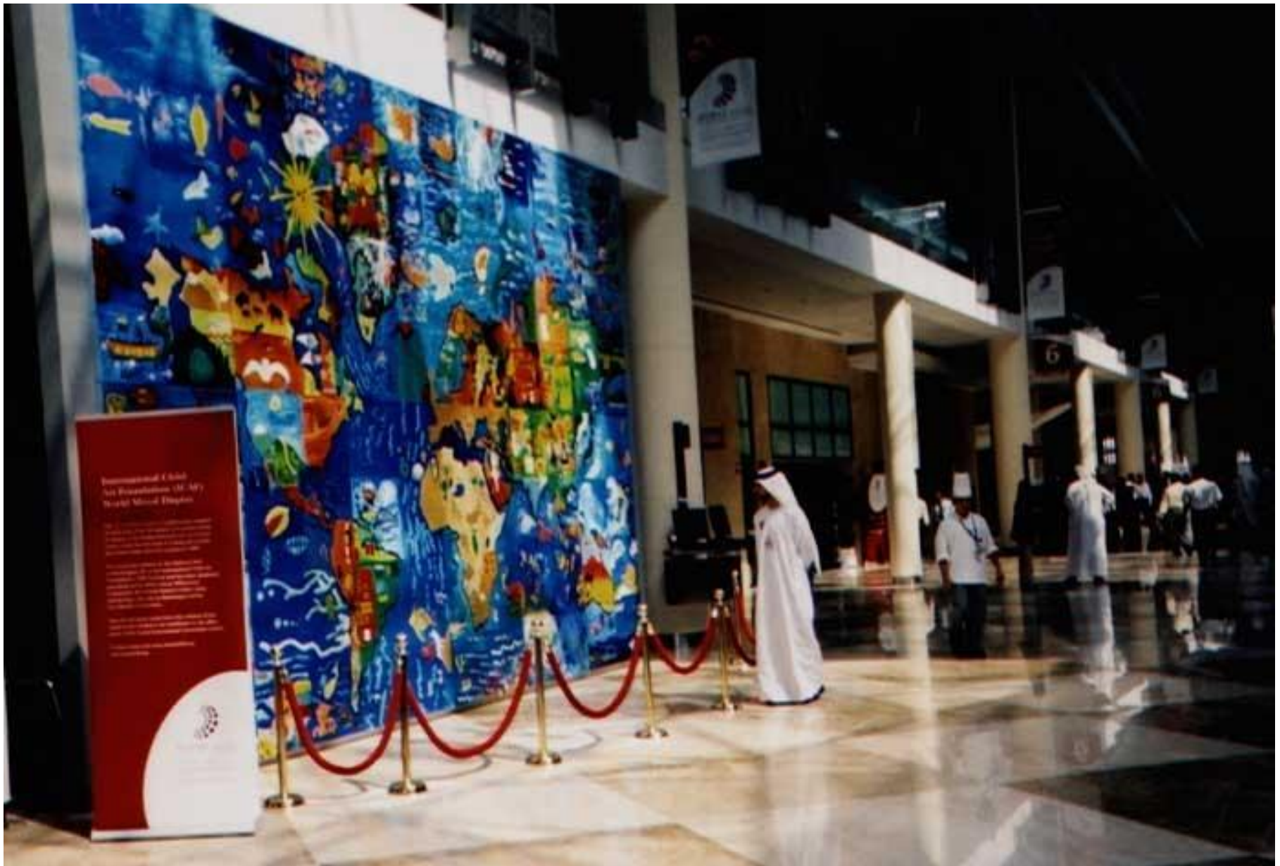
Children's World Mural at the World Bank/IMF Annual Meetings in Dubai, UAE in December 2003