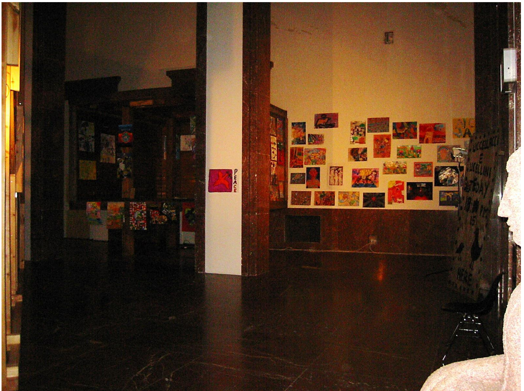
Children's Utopia Exhibition at Haus der Kunst in Munich, Germany, in October 2004