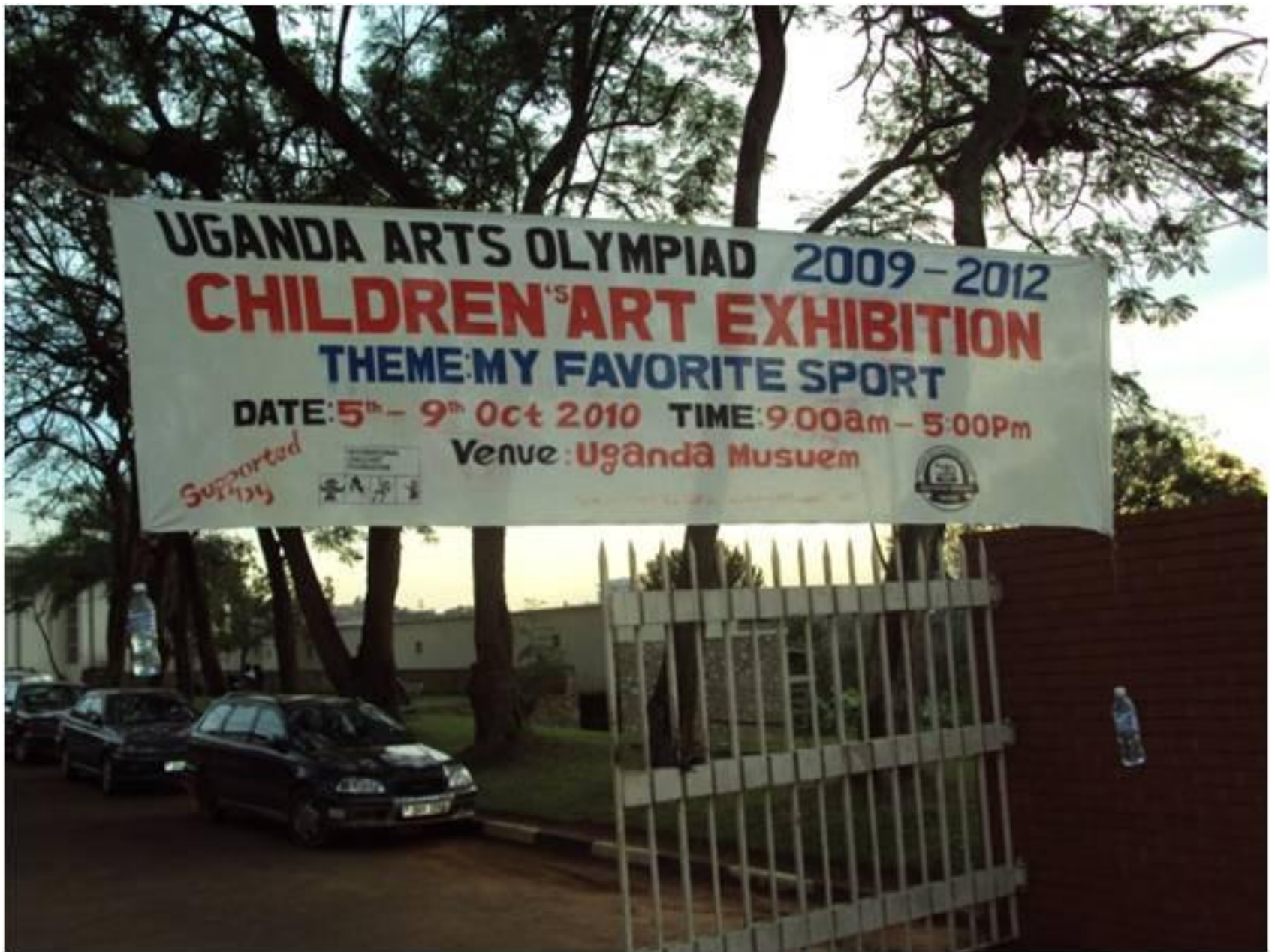
Arts Olympiad exhibition at the Uganda National Museum in Kampala in October 2010