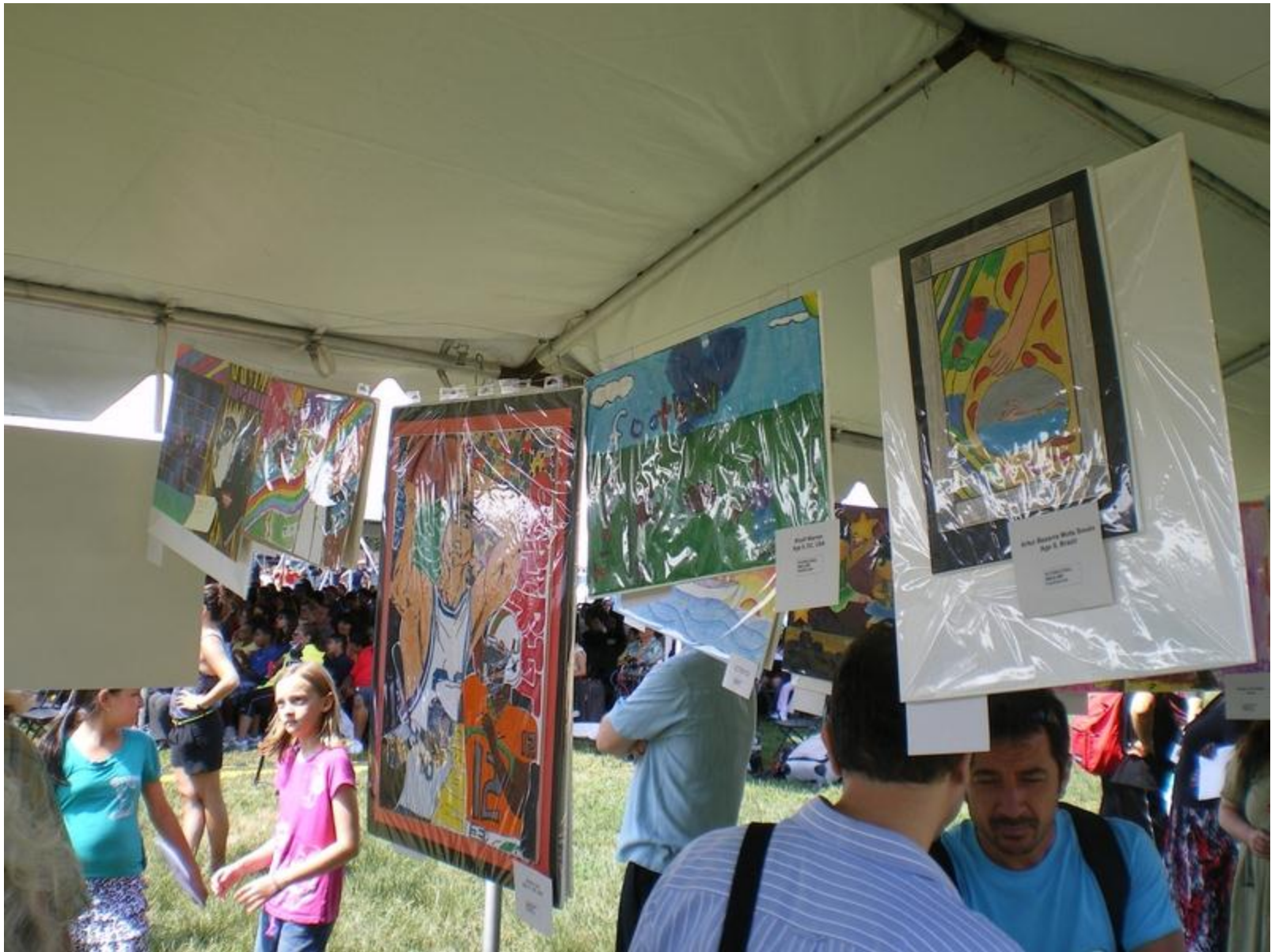
Fourth Arts Olympiad Exhibition on The National Mall in Washington, DC in June 2011