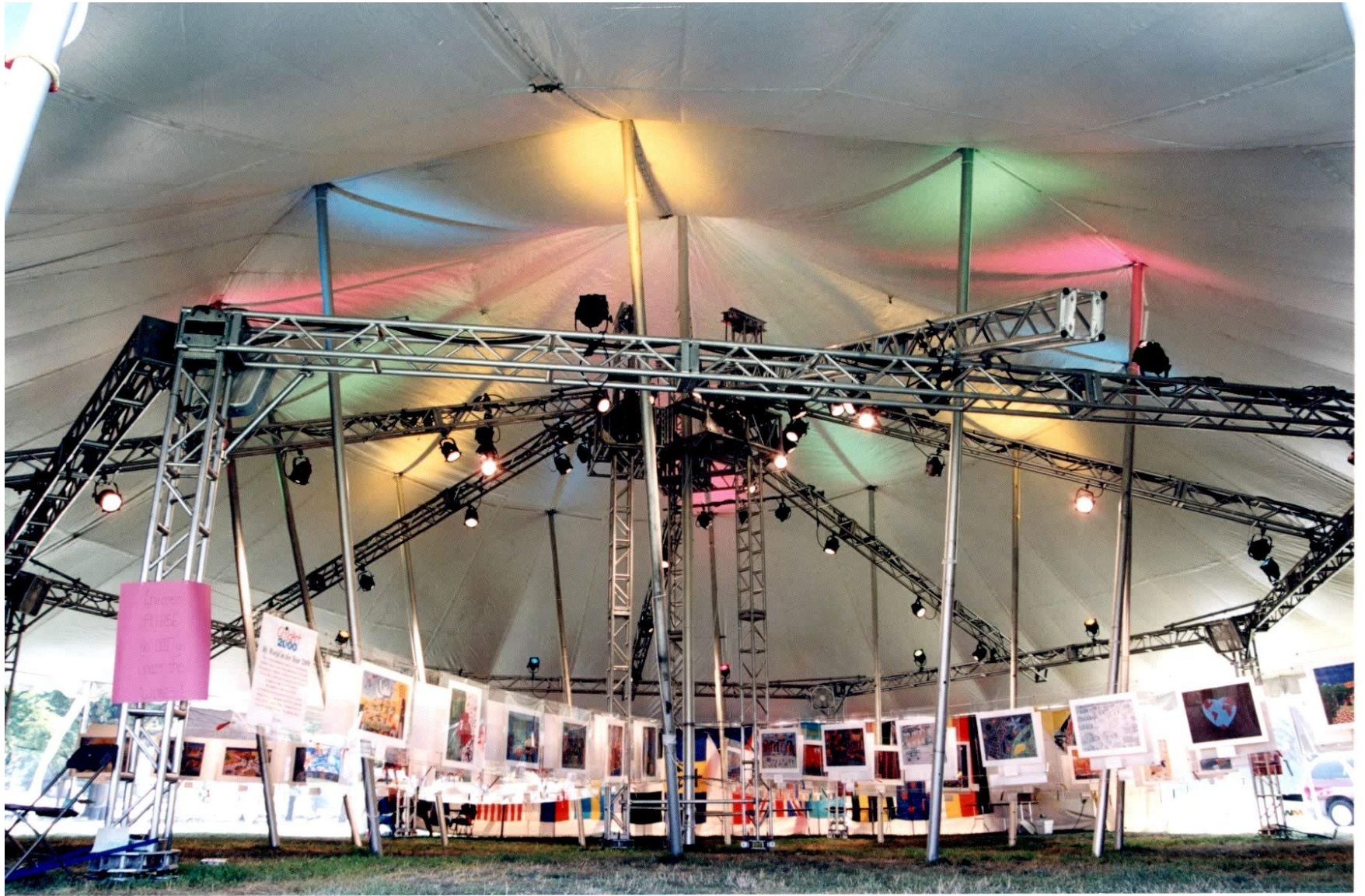
First Arts Olympiad Exhibition setup on The National Mall in Washington, DC in September 1999