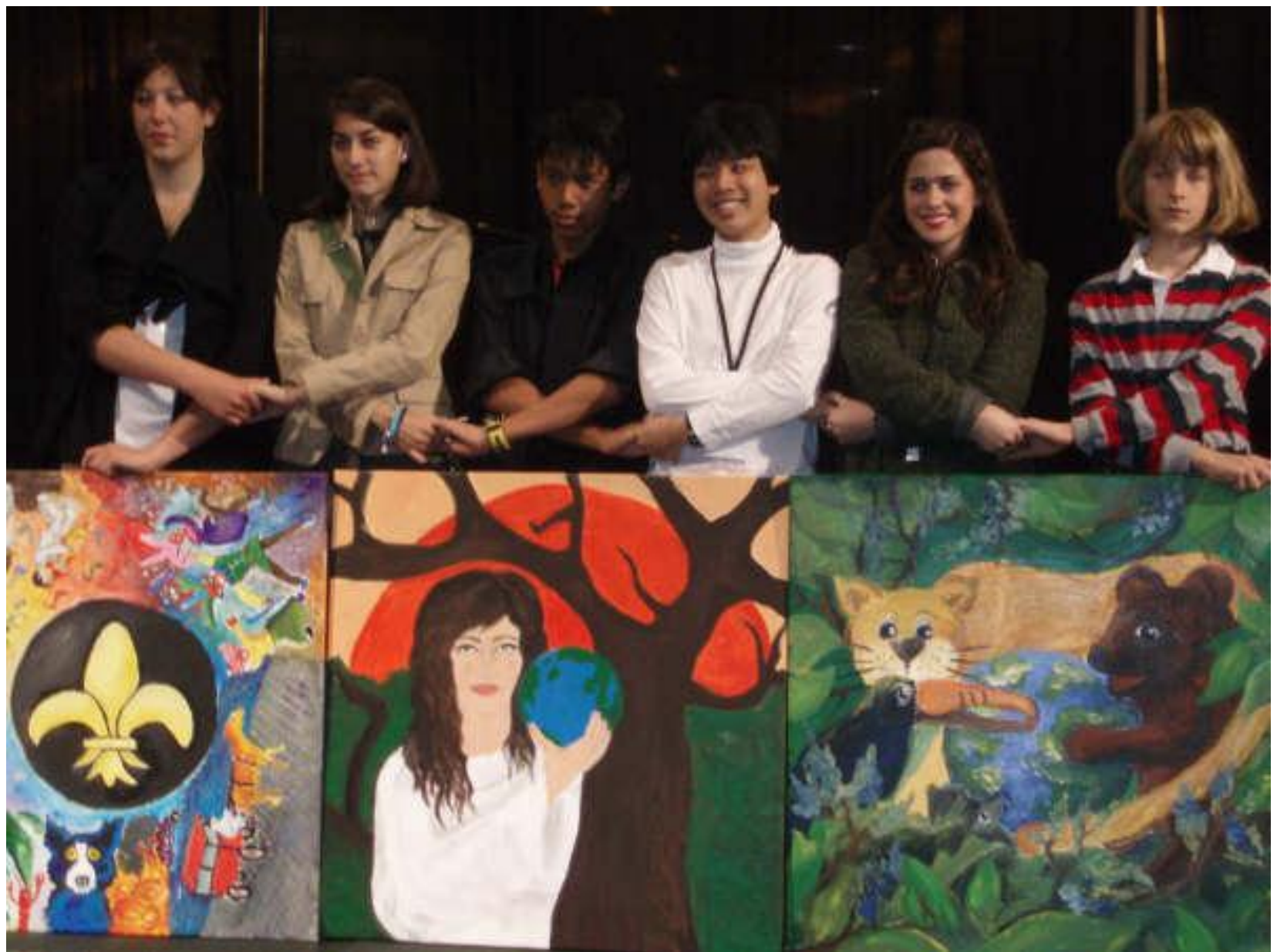
Exhibition at Ernest N Morial Convention Center in New Orleans during the World Cultural Economic Forum in October 2008