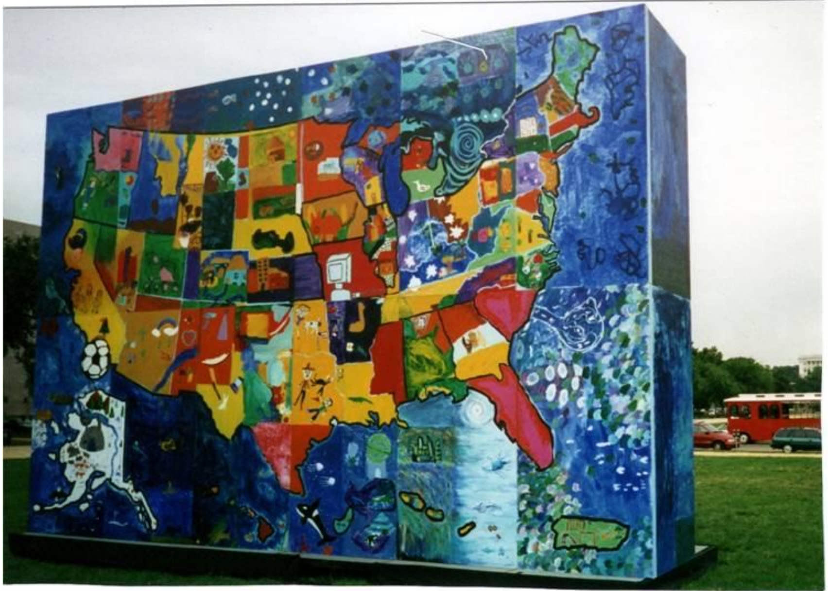
Children's America Mural on display at The National Mall in Washington, DC in September 1999